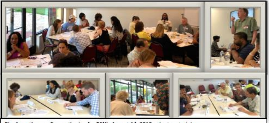
Pics from the overflow gathering for RSN's August 14, 2018 volunteer training.

WHO WE SERVE RSN works with youth suffering from substance use disorder (SUD) and/or mental health issues (MHI) and/or encounters with the justice system (JS).